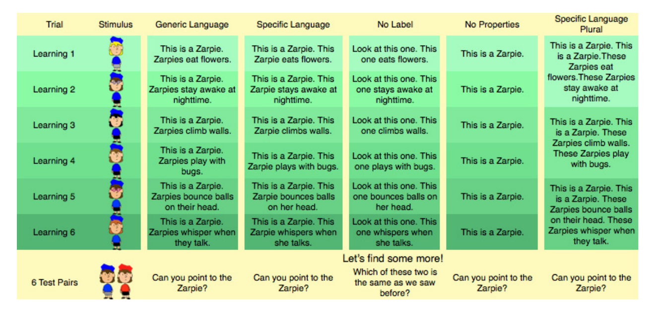
Figure 1. Overview of the experimental task.